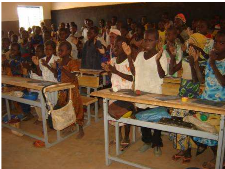
In Our Classroom

Child participation, survival, water and sanitation, education and protection.