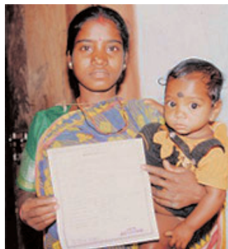
Now, my son has an identity - A birth certificate

Child centered programmes with participation of children: Plan believes in child centered community development. Through its programmes, Plan along with its partner organisations strives to empower children, families and communities so that children's rights are recognized and issues affecting them are amongst the wider agenda of adults, civil societies and the government.