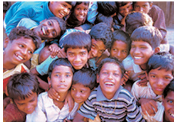
Our name is Today

Over the next five years Plan together with its partners, aims to reach out to some of the poorest areas of the country, in the states of Bihar, Madhya Pradesh, Orissa, Rajasthan, Uttarakhand, Uttar Pradesh, Jharkhand and Chhattisgarh (marked in blue on the map). Plan will gradually move out of the Southern states, Andhra Pradesh, Karnataka, Maharashtra and Tamilnadu, where it has been working for many years and which show improved health, education, and overall standard of living.