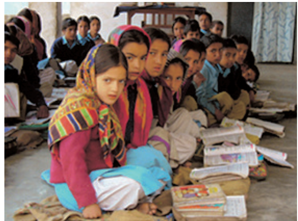
Education – the road to empowerment

All Children should have Quality Education: Plan works closely with communities, children, parents, teachers and local government to improve the quality of education, to make the schools child friendly and to ensure school attendance. Parents are motivated to continue education of their daughters.