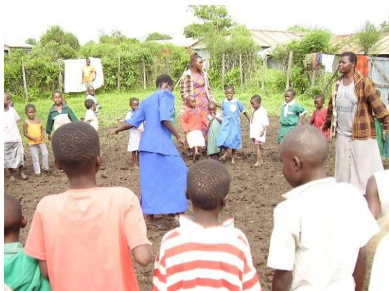
Learning through play

Education: Education provides a firm foundation for children and contributes towards human development. In the rural areas, education is probably the only opportunity that ensures a better future for children.