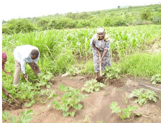
Improved farming practices

Improved farming practices are a challenge, owing to high cost of tools and equipment. As a result, farmers continue using inappropriate farming tools resulting to low harvests.