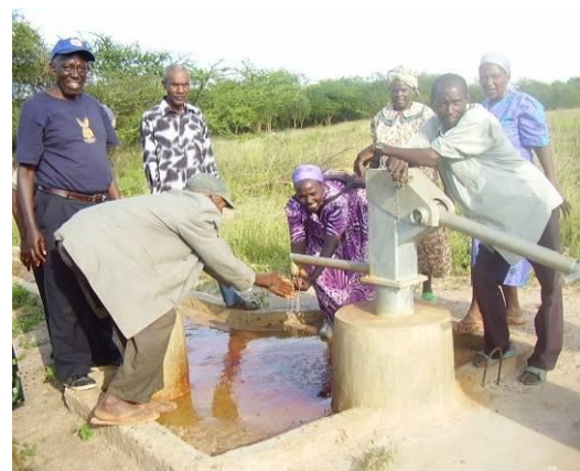
Clean water available