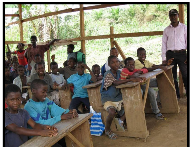
Children discussing issues on birth certificates.