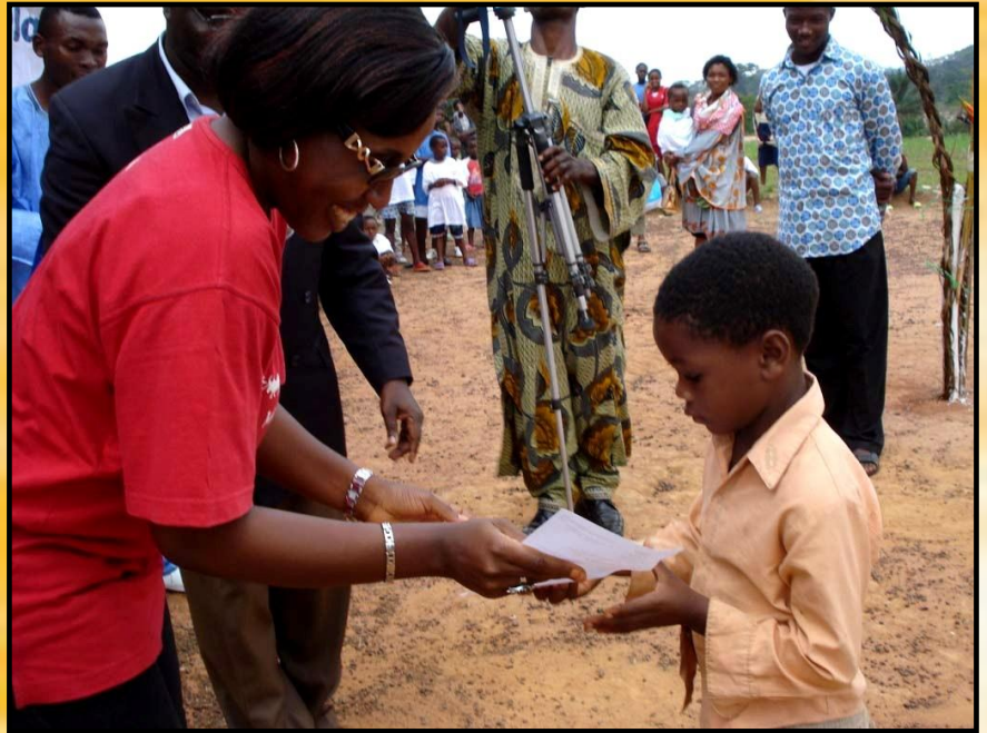
A child receives a birth certificate from a Plan official.

This is to create awareness among parents on the need for birth registration. The main aim of this project is to give the children the ability to talk about and understand issues affecting their rights such as birth registration.