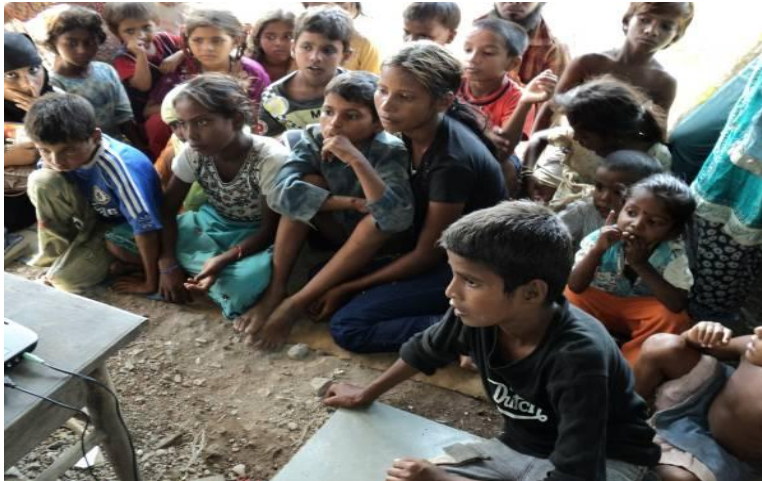
Awareness session on personal and environmental hygiene

The situational analysis also throws light on maternal & child health; it is a well known fact that the health of the mother during pregnancy is directly related to the health condition of the child at birth. 91% of the mothers have had at least 3 antenatal care visits during the birth of their last child. In Garib Nagar, the proportion was lowest (87%) in comparison to the other two locations.