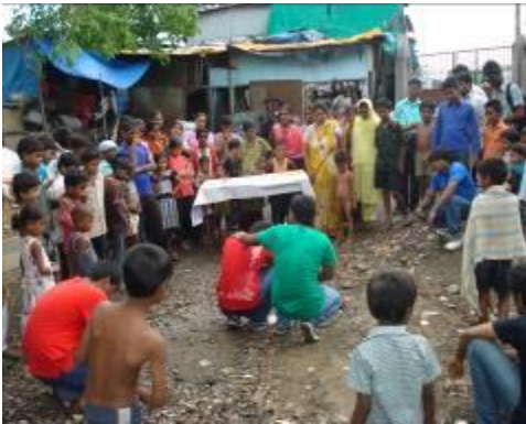
Sensitisation camp on vocational training

A situational analysis shows that 30 % of the population here is illiterate. 48 % of the adults are employed as tailors. The majority of the population are labourers employed on a monthly basis or are small traders.